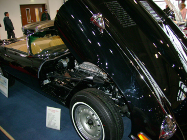
1935 Buick Wildcat Engine: 4.9L I-6 Horsepower: 40 Chassis: 1200 Body: 1200 Color: Black Interior: Yellow Year: 1935