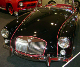
1934 The car is a 1934 model, featuring a black body with red pinstriping and a chrome grille. It is displayed in a museum setting.